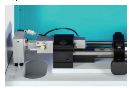
Press start and begin the measurement