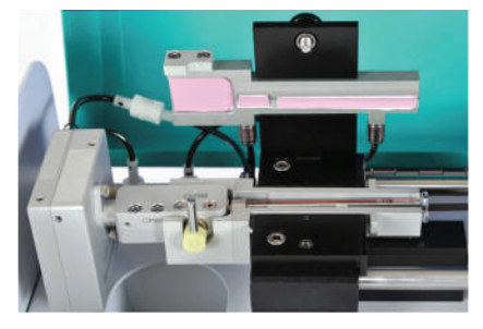
Thread the syringe into the measuring cell and close the thermal jacket